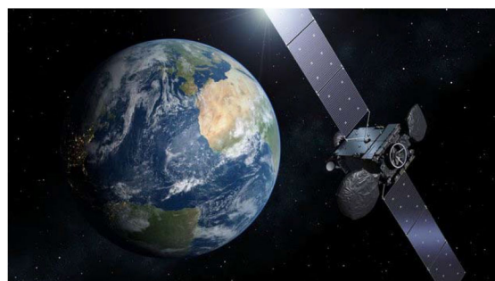
Fig. 3 Example G-CLASS spot beam coverage (C-band, 7 \text{ m} diameter antenna; implemented with SPOT/TOPS imaging modes); the diagonal line shows the G-CLASS orbit projection on earth's surface, dashed lines show local incidence for an orbit centred at 20^\circ\text{E}

The communication link is straightforward since the satellite has a permanent link to its ground station, and the data bandwidth ( 100 \text{ Mbit s}^{-1} or lower) is not especially demanding. Significant signal processing is needed on ground to focus the coarse and fine resolution images. The various effects (atmospheric phase variations, orbit drift, clock synchronisation) which need to be tracked and compensated for are the main technical risk for the mission [9].